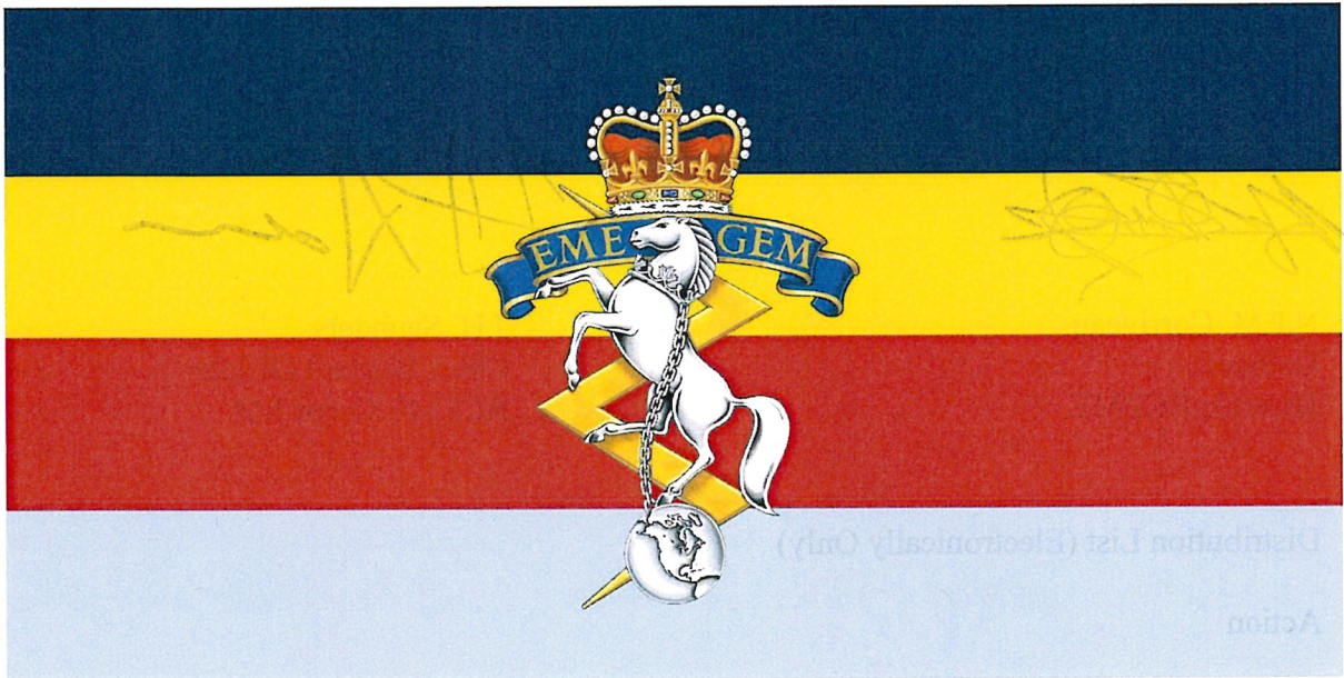
Director - RCEME Directeur - GEMRC